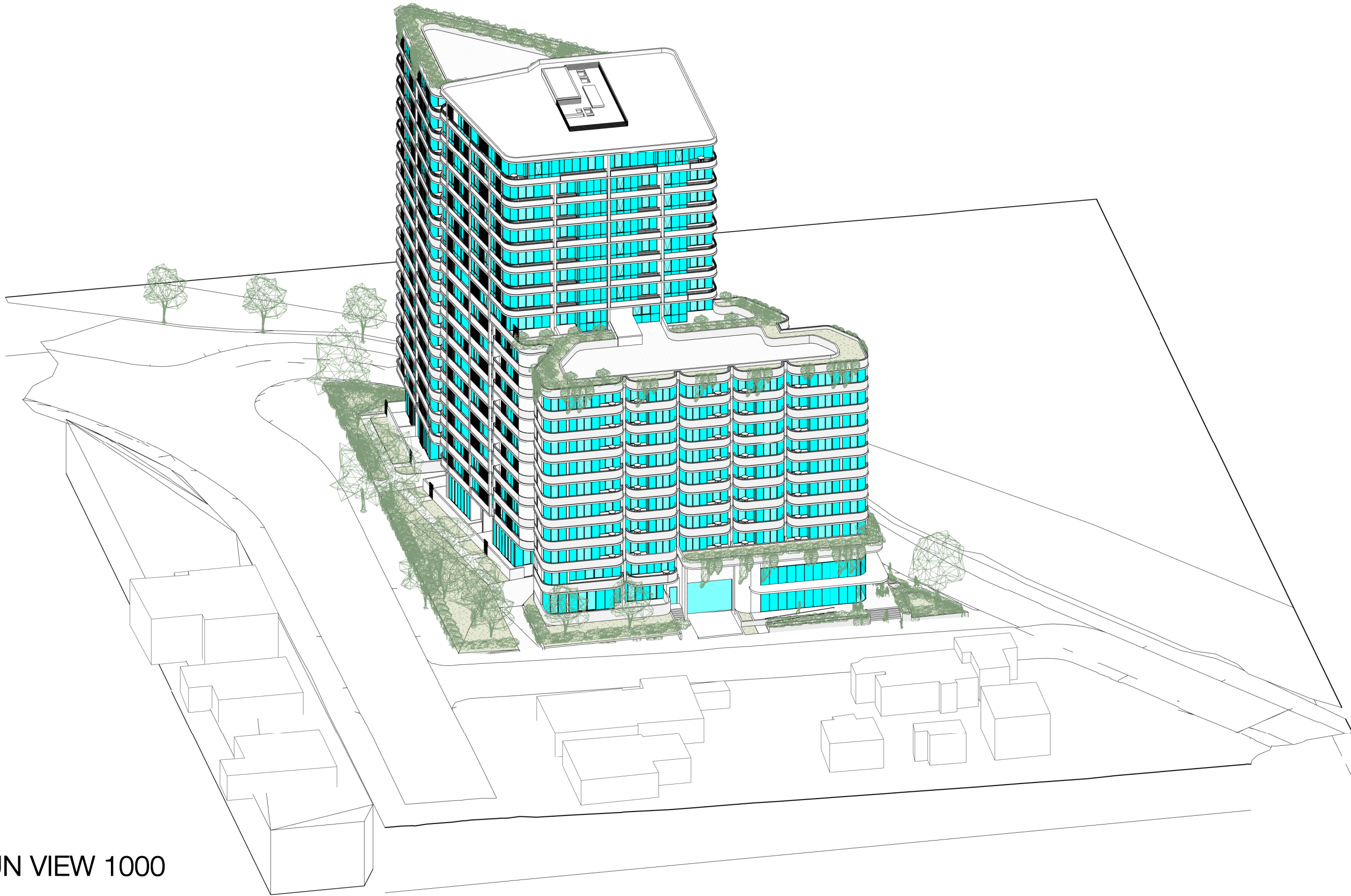
SUN VIEW 1000